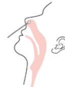
b) Nasal swab